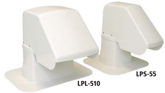
(Figure 1) Product Images:

Finish Aesthetically pleasing, professional look