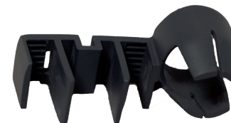
UNIVERSAL PIPE CLAMP

Determine pitch necessary and snap Universal Pipe Clamp into stanchion.